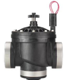
ICV-301 Inlet diameter: 3" (80 mm) Height: 27 cm Length: 22 cm Width: 19 cm