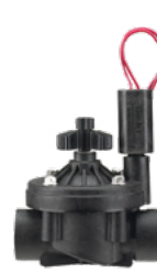
ICV-101G Inlet diameter: 1" (25 mm) Height: 14 cm Length: 12 cm Width: 10 cm