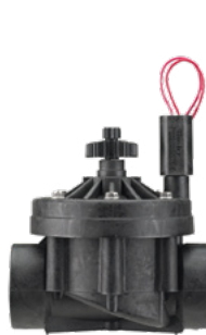
ICV-201G Inlet diameter: 2" (50 mm) Height: 18 cm Length: 17 cm Width: 14 cm

* Accu Sync product information on page 94