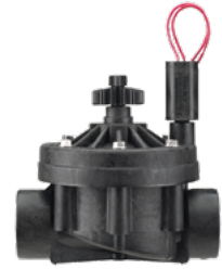
ICV-151G Inlet diameter: 1½" (40 mm) Height: 18 cm Length: 17 cm Width: 14 cm