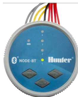
NODE-BT Diameter: 8.9 cm Height: 8.3 cm

The Bluetooth® word mark and logos are registered trademarks owned by Bluetooth SIG Inc. and any use of such marks by Hunter Industries is under license. iOS is a trademark or registered trademark of Cisco in the U.S. and other countries and is used under license. Android is a trademark of Google LLC.