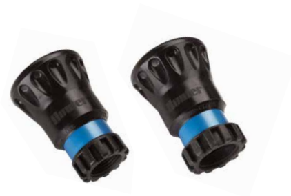
SpotShot Hose-End Nozzle ¾" P/N 160700 1" P/N 160705